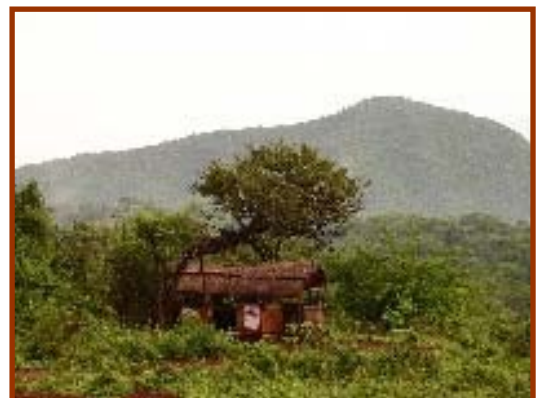
the countryside around Mitunguu

The coop is keen to host travellers , and they offer accommodation and meals, shows of traditional music and dance, and visits to some farms around, in the luxurious (at least in rain season) countryside South of Meru. Spending some days in this place is probably the best way to help the coop, besides buying their products, available in any Fair Trade shop in Italy.